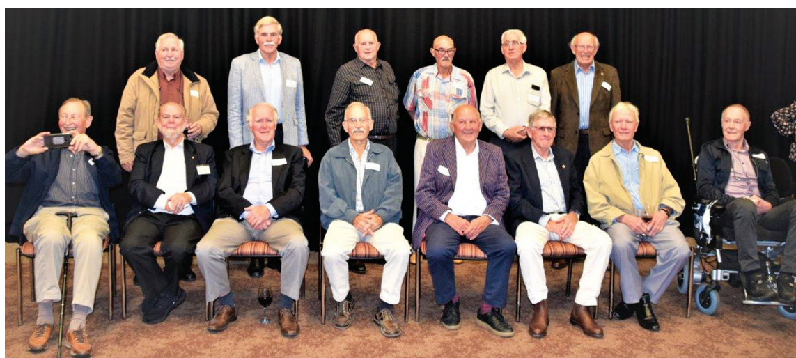
1970 – the first Tertiary Graduates (Fellows)