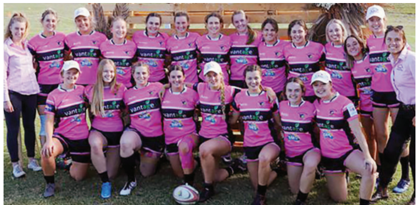
Gatton Black Sows 2021

In the lead up to the event keep up to date with the exploits of the Black Pigs and the Sows in 2022 on our Facebook page. Aren't on Facebook? check out the Downs Rugby website for updates.