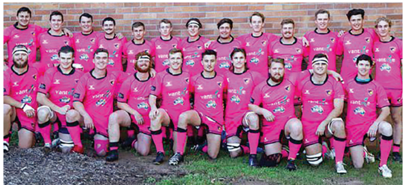
Gatton Black Pigs 2021