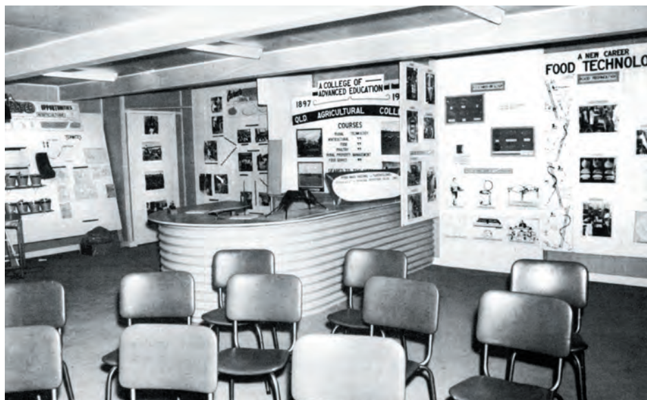
Display at RNA Exhibition 1973

Detailed information will be sent closer to the event.