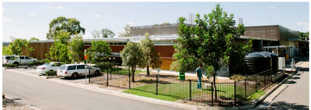
UQ Veterinary Medical Centre at the Gatton Campus

Investment, expansion and growth are key words in the role which UQ Gatton contributes to the rural sector in this modern age.