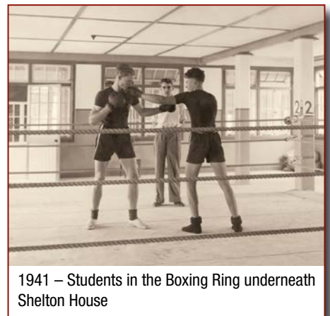
1941 – Students in the Boxing Ring underneath Shelton House