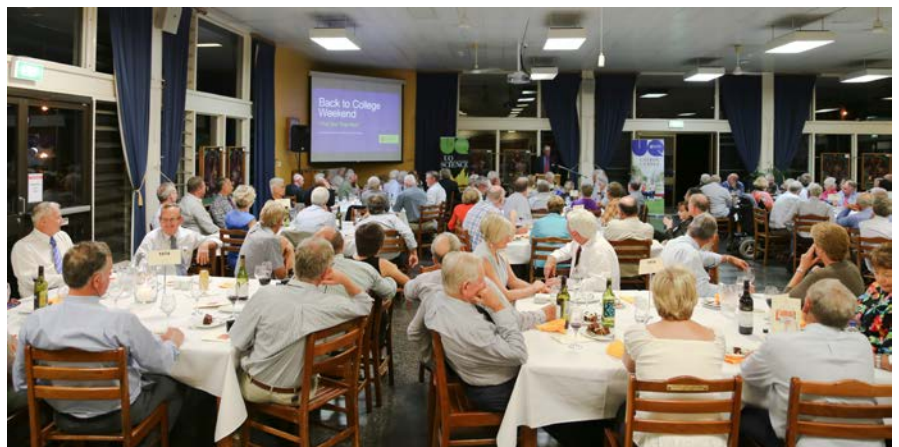
Members of the UQG Past Students' Association enjoying the Back to College Presentation Dinner.

Another great example of a Gatton graduate achieving on the world stage.