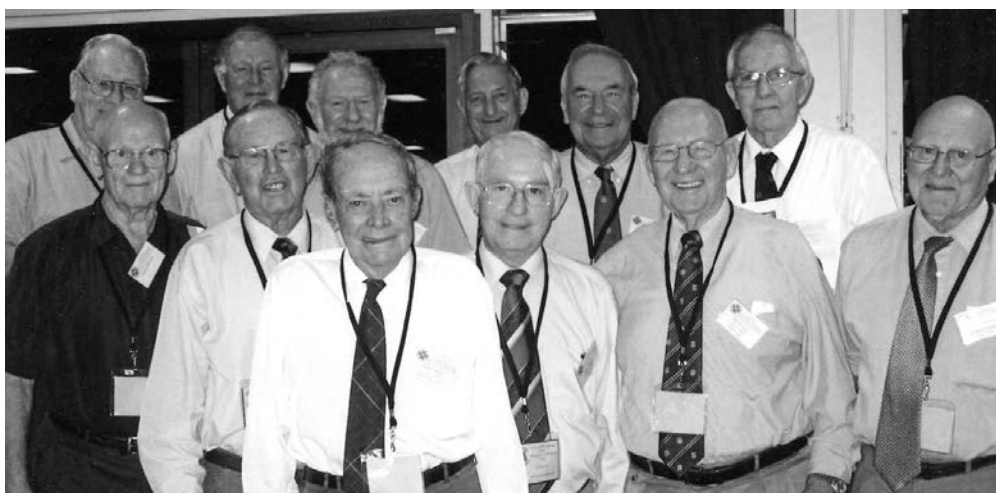
1948 Group 60 Year Reunion – Back to College Weekend December 2008

This year the feature years are those who graduated in 1999, 1989, 1979, 1969, 1959 and 1949 and the reunion will be held over the weekend of 5 and 6 December. A reunion of former staff will also be held over lunch on the Saturday.