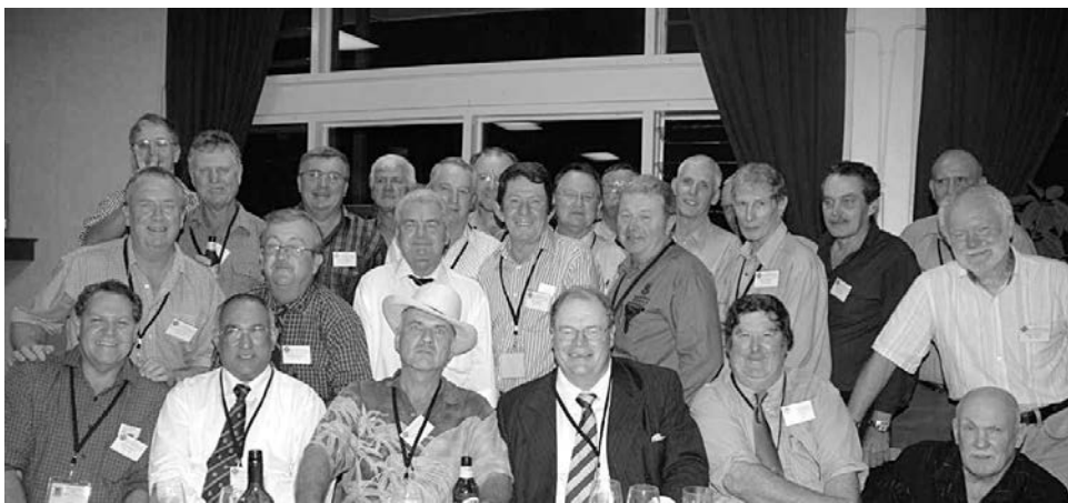
1968 Year Group