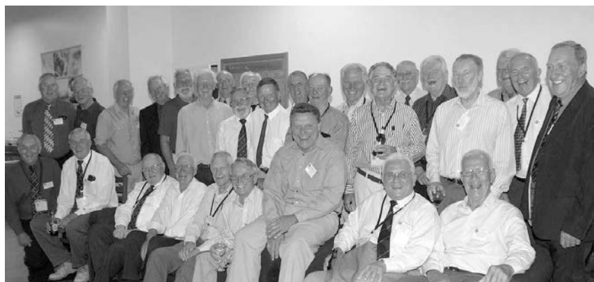
1958 Group 50 Year Reunion