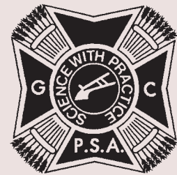
The old PSA badge/logo

Part two and conclusion to the saga in Summer edition of Re-Connect.