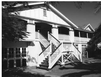
Morrison Hall (Old Shelton) where the new Past Students' Museum is located.