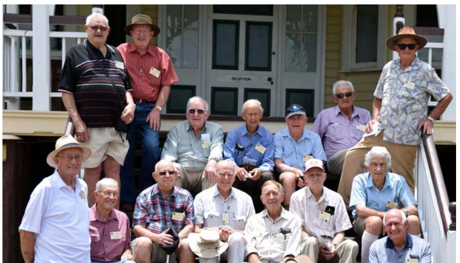
Year groups at Back to College Weekend

Enjoy this edition of Re-Connect and see you at our 2018 events.