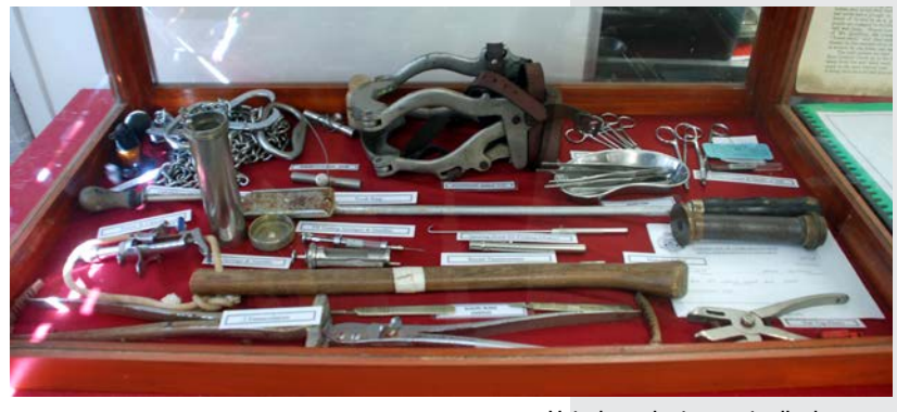
Veterinary instruments display case

A large assortment of veterinary instruments, Gary Mason (Wally Mason).